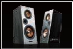
KRATOR N2-20050 2.0ch 50 Watts Speakers