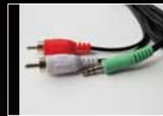
3.5mm to RCA audio cables