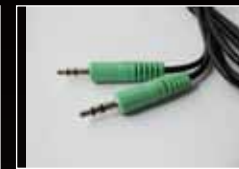
3.5mm to 3.5mm line-in cable