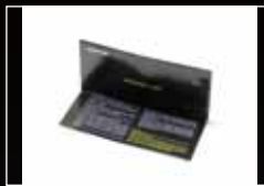
Customer Warranty Card