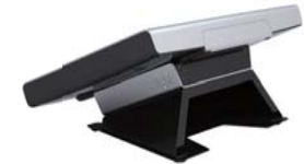
Easy for maintenance

A compact desktop PC features 15" touch screen and is designed for hospitality market. The fanless and modular designs deliver the benefits of quiet operation and flexible expandability for MSR, fingerprint, iButton, RFID and Wi-Fi.