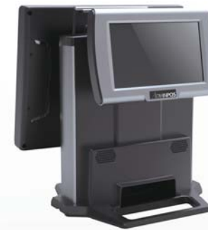
8.9" LCD customer display