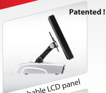
Detachable LCD panel