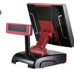
Pole type VFD