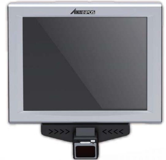
With 1D Omnidirectional Laser Scanner

In addition to be a price checker, AdvanPOS price checker can also dynamically display the product advertisement, promotional announcement and customer entertainment. A touch screen is embedded to enhance the interactions with customers.