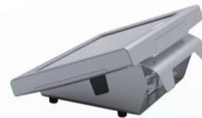
Cable free peripheral