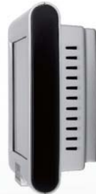
QP-3000 : Intel Atom CPU Z530 / Z510 embedded

QP3010 and QP-3000 are Table Top Ordering system designed specifically for the hospitality market, and can be wall-mounted for any POS applications. Adopting the latest Intel Atom technology, QP3010 / QP-3000 are fully integrated POS systems which not only help to improve operating efficiency but also provide an interactive ordering experience for customers.