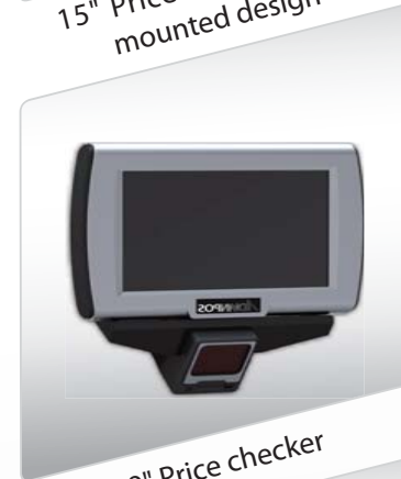
8.9" Price checker