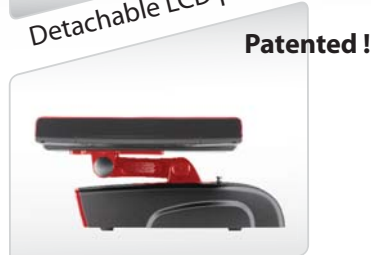
Dual hinge design