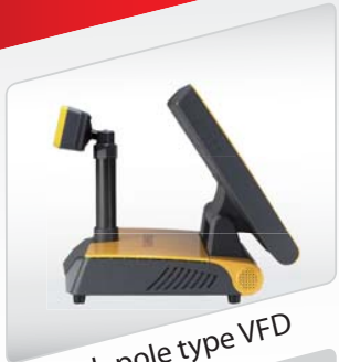
With pole type VFD