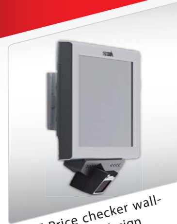
15" Price checker wall-mounted design