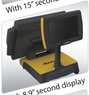
With 8.9" second display