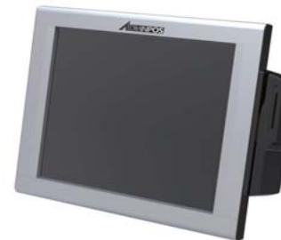
17" WPOS with MSR module

With swing arm and non-swing arm solutions