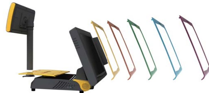
Patented changeable bezel design