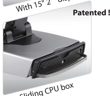
Sliding CPU box