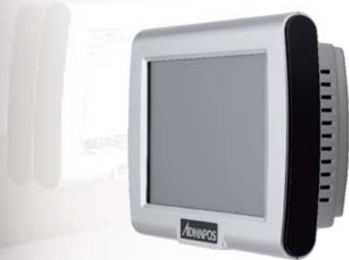
QP-3010 : Intel Atom CPU N270 embedded