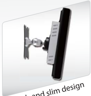
Stylish and slim design