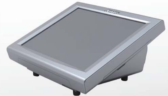
Simplicity in base design