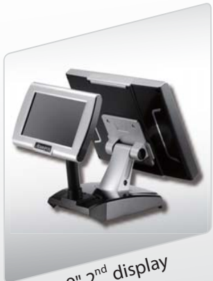
8.9" 2 nd display

A slim design touch POS system with Intel Atom N270 CPU, Z-POS Lite is a totally fanless and heatless power efficient POS that offers uncompromised reliability and robustness.