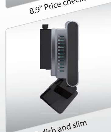
Stylish and slim