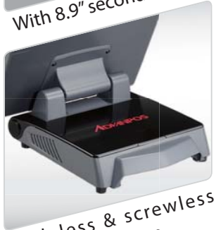
Cableless & screwless back design