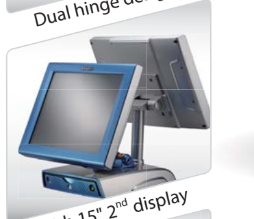
With 15" 2 nd display