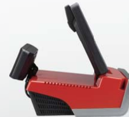
Compact design, portable & small footprint

The ultimate compact POS terminal designed for small counter space applications. Adopting Intel's latest Atom technology, Q-POS is capable of running as a fanless system with minimal power consumption.