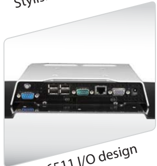
WP-6511 I/O design