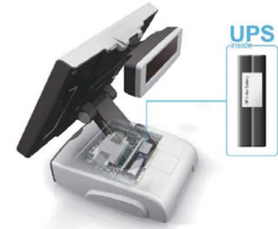
UPS back up battery up to 20 minutes