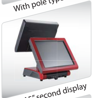
With 15" second display