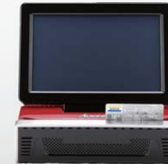
Card reader function provided (optional)