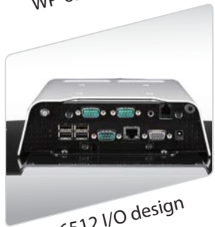
WP-6512 I/O design